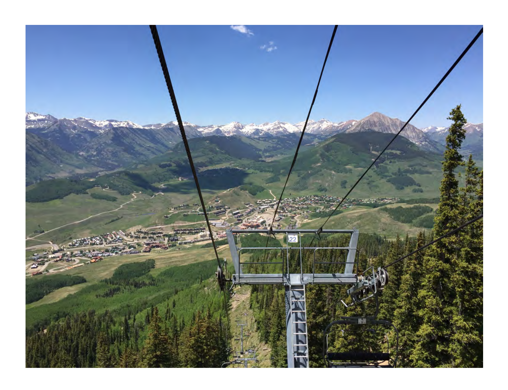
The View from the Chair lift of Crested Butte