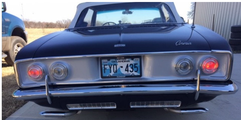
Dave's New clear lens