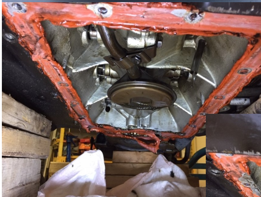
This is what happens when you use RTV vs the proper gasket