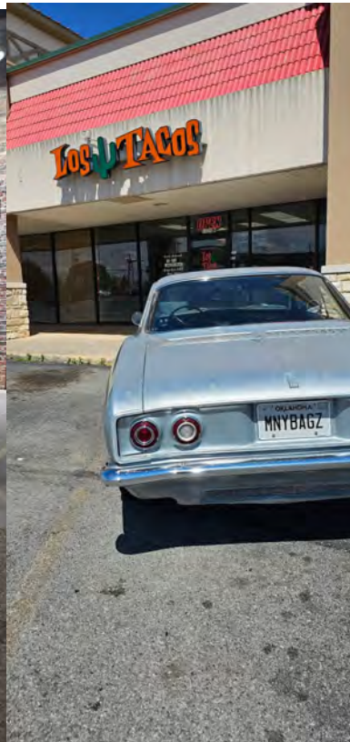
Meeting pictures and road pictures out and about