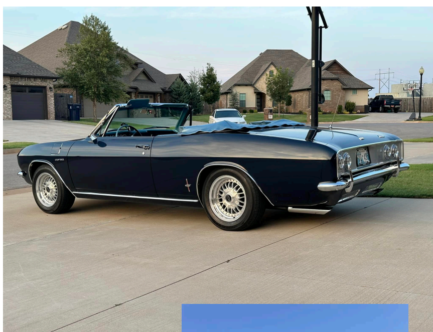
David Clamps car back on the road