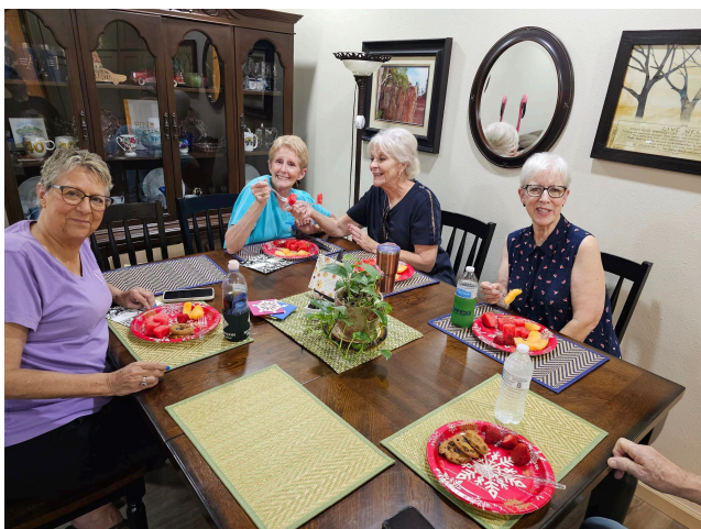
Watermelon Fest at the Ranch