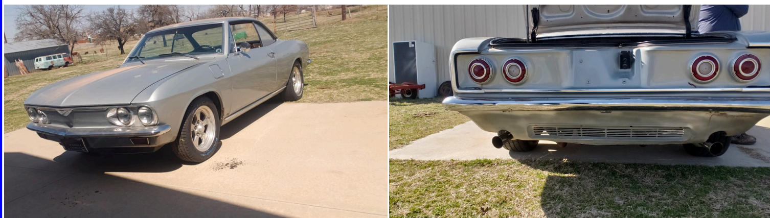
Cam Cummings late model Corvair engine rebuild