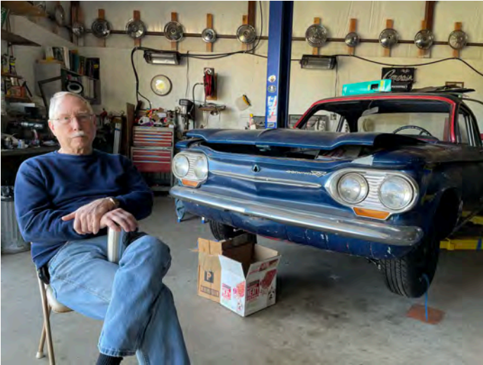
Rex enjoying the conversation